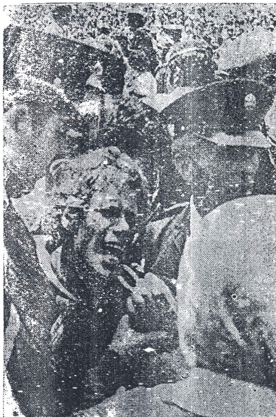
The accompanying photo shows one father overcome with grief.

KIRYAT SHMONA. — About 10,000 persons on Friday attended an emotional State funeral of the 18 civilian victims of the Arab terror